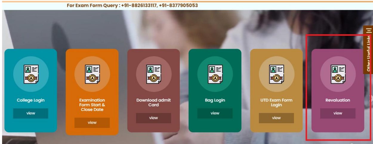
Fig.1. College Login link

Step 2:- click on Reevalutaion link.(Fig.1)