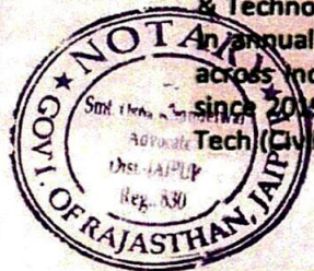
Photo Attested Notary Public JAIPUR

Poornima Institute of Engineering & Technology is a premier institution in Engineering Education, established in the academic year 2007; It is affiliated to Rajasthan Technical University (Kota), approved by AICTE, and is recognized by UGC under section 2(f). Poornima Institute of Engineering and Technology is meticulously working with its full potential in all dimensions to generate excellence in academics and in overall development of its students. It is the learning home to more than 1500 students and is committed to imparting the best technical skills in students through its six specializations of Engineering at UG level namely B. Tech in CSE, AI & DS, CSE (R), CSE (AI), CSE (DS) and CSE (IoT). Poornima Institute of Engineering & Technology is spearheading its outstanding voyage with many achievements like Ranked 3rd in annual QIV ranking (Consistently 3rd for last 04 years) by RTU. PIET is the 1st Institution across India to offer B. Tech CSE in Regional language under NEP 2020. Accredited by NAAC since 2019 and Accreditation by NBA for B. Tech (CSE) program for the last 06 years and for B. Tech (Civil Engineering) program in 2019-20 and was 1st across Rajasthan to achieve the same.